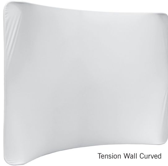
Tension Wall Curved