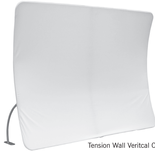
Tension Wall Vertical Curve