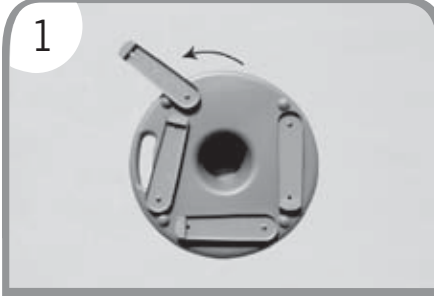
1. Turn the base (A) upside down and slide all legs into the extended position.