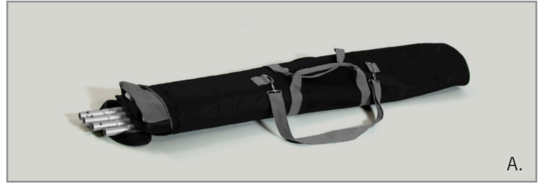
A. Pole kit and carry bag